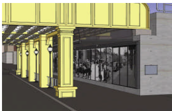
Artist's rendering for Federal St. Underpass

Teams from eight Northside institutions meet at McCabe field in North Commons Park to play softball every Monday night throughout the summer of 2009.