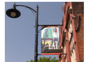
Sky Art along East Ohio Street

Art banners created by local artists and installed on light poles along East Ohio Street, May 2009. A project of Artists Image Resource and Northside Leadership Council