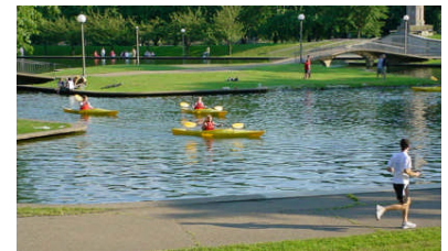
Kayakers on Lake Elizabeth

Daily kayak rentals will be available on Lake Elizabeth in Allegheny Commons beginning May 23 and continuing through Labor Day 2009. A project of Venture Outdoors with Allegheny Commons Initiative